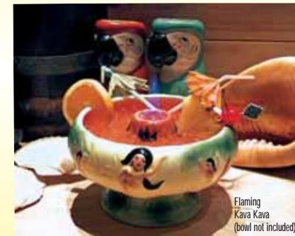
Flaming Kava Kava (bowl not included)